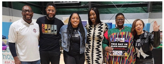
Honoring History, Empowering Our Future Leaders!