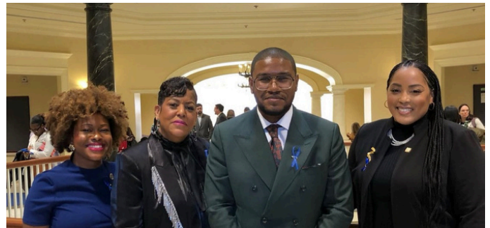
Supporting Erik's ID Law (HB707) Together!