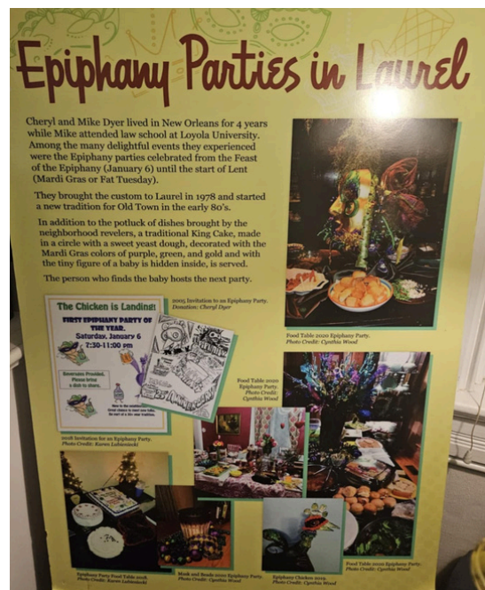
Epiphany Parties in Laurel